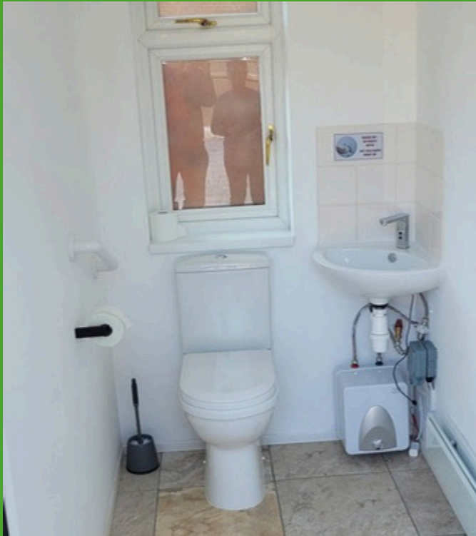
Completed Toilet Facility (above)

The impact has been we now have fully accessible facilities, greater independence for disabled visitors as well as safe, modern amenities available beyond opening hours. The new features are already attracting more female and disabled bowlers, and enhancing the club's community appeal.