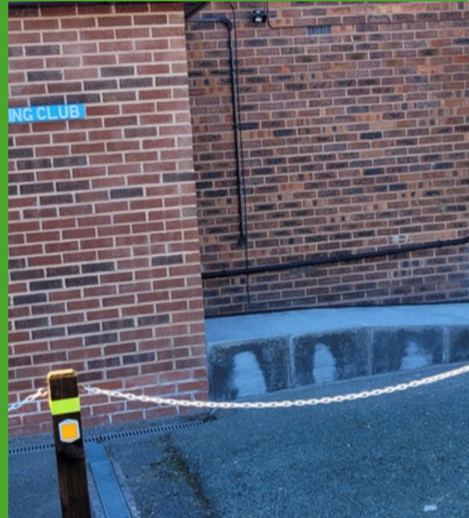
Completed Ramp Access (above)

What we learnt was we need to double-check builder credentials and experience. We should have confirm ramp dimensions early to avoid late design changes but I don't think we could have envisaged the price changes post-COVID.